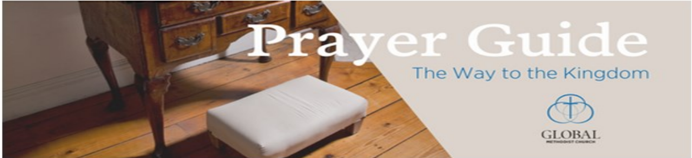
Photo: John Wesley's prayer kneeler – The birthplace of Methodism.

Each morning at 4 a.m., John Wesley would kneel in prayer in his London home. It was in this place that the fires of Methodism began. As we seek to reconnect to our Wesleyan heritage, it seems the best place we can begin is in prayer. Join us in our monthly prayer series: The Way to the Kingdom.