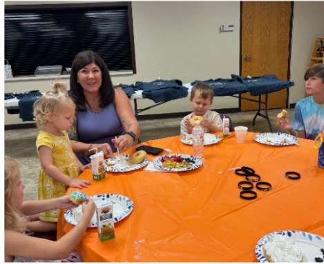
Waffles, eggs, and plenty of smiles -- a great start to a new school year!