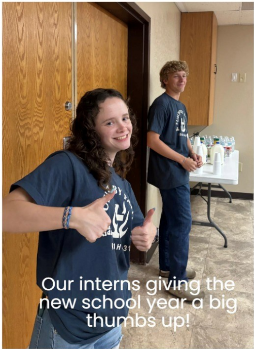
Our interns giving the new school year a big thumbs up!

Sunday morning was such a treat! Families gathered for our Back-to-School breakfast, enjoying a waffle bar, scrambled eggs and plenty of smiles as we prayed over the kids heading into a new school year. Our prayer is that each child walks into the year fueled by faith, surrounded by love and reminded that their church family is cheering them on every step of the way.