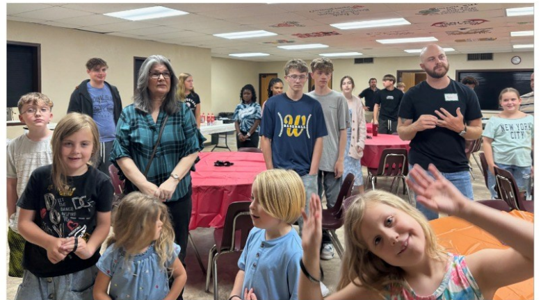
Happy faces, full plates, and hearts ready for the year ahead.