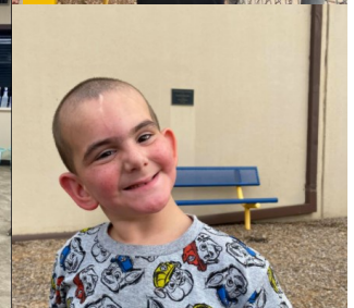
Kings & Queens Respite Care