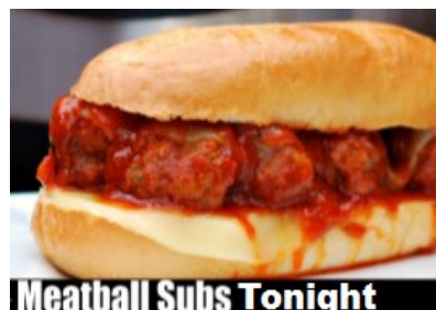
Meatball Subs Tonight

Every Wednesday from 5:30-6:15 Everyone welcome. Cost is only $3. Wednesday Programming