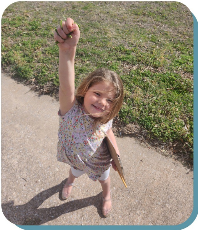
Joyfully exploring God's world!