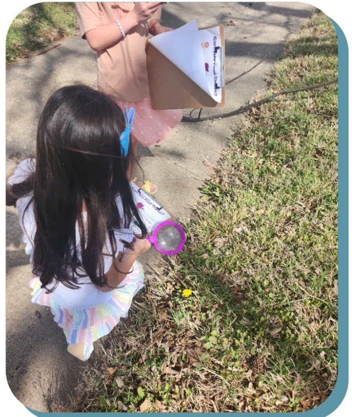
On a garden scavenger hunt -- discovering God's creation!