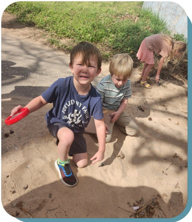
Learning and growing together in God's garden!

This week in Wee Worship, our children stepped back into the Garden of Eden to learn about the difference between temptation and sin.